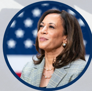
Kamala Harris President

LOCALLY, THE LEVY DEMOCRATS FULLY SUPPORT: