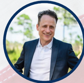
Sylvain Doré Florida Senate District 9